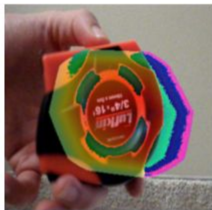
New Class: Measuring Tape